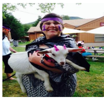
amp Phone Number after June 1